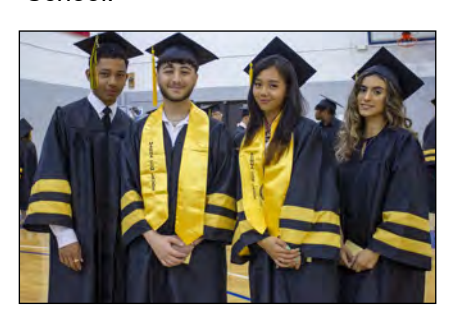
Members of the SHHS Class of 2023

The Class of 2023 included 94 students from Community High School, 228 from Cousino High School, 296 students from Sterling Heights High School, and 320 students from Warren Mott High School.