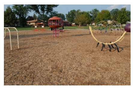
Playground upgrades at Holden Elementary.

The improvements were made possible through a $134.5 million bond proposal, which was approved by voters in May 2016, to preserve the district's facilities and remain competitive as one of Macomb County's leading school districts.