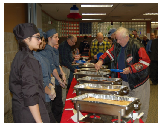
More than 35 veterans were in attendance for the annual CPC Veterans Day Celebration.

Center recently hosted a Veterans Day celebration honoring service members for their courage, dedication and service to our country.