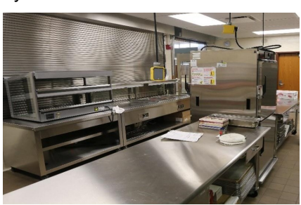
State-of-the-art kitchen at Butcher.

Butcher Educational Center received a new state-of-the-art kitchen and theatre A/V and lighting upgrades, as well as security and technology upgrades and a new phone system.