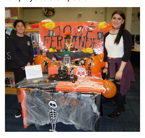
SIERSMA DIVERSITY CIRCUS

The students created display altars with offerings or ofrendas. The altars were decorated with mementos such as pictures, bright flowers, candles, and favorite foods and beverages. Students were required to research and present their displays to their peers.