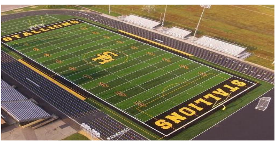
A running track, football field turf and stadium sound system were installed at Sterling Heights HS.

Several improvements took place at the middle school level such as new ovens in each kitchen, the installa-